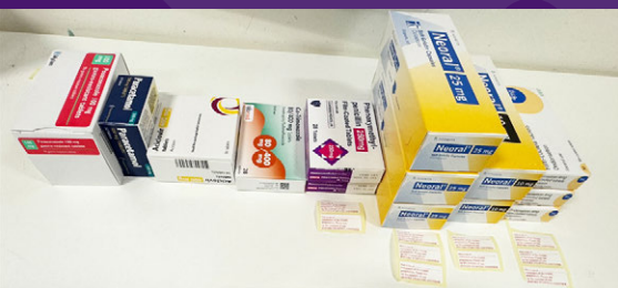
Equivalent medication in pill form