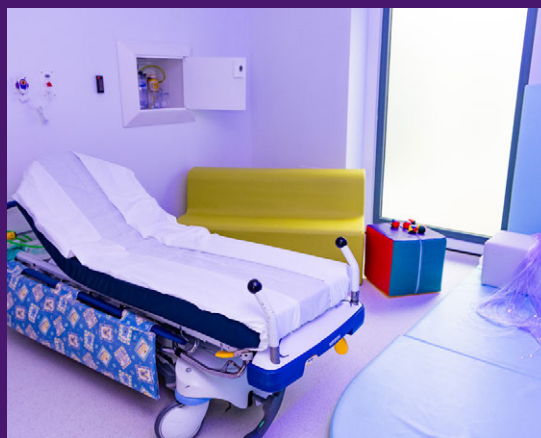
Day surgery after