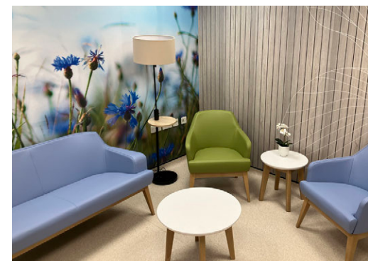
Maternity Counselling after

Two support rooms have recently been enhanced in the Queen Elizabeth Maternity Hospital. The transformation above was very kindly funded by the Rory and Romeo Graham memorial funds, held by Glasgow Children's Hospital Charity.