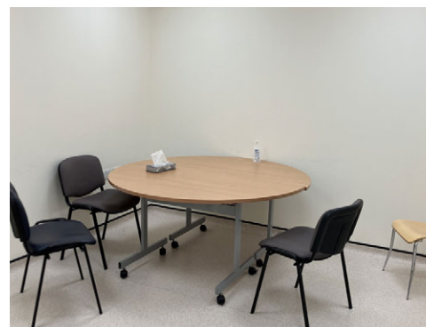
Maternity Counselling before