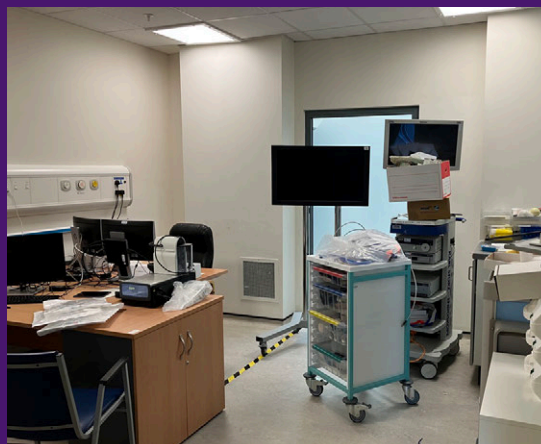
Day surgery before